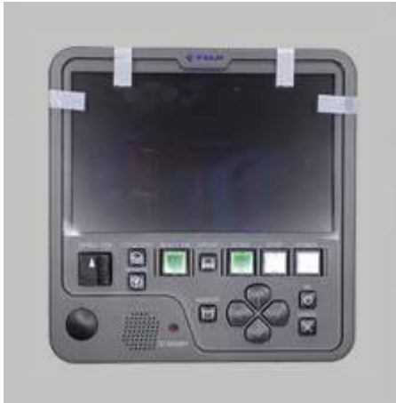
AIMEX Control Panel