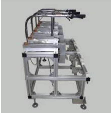
M3 Pallet Storage Unit