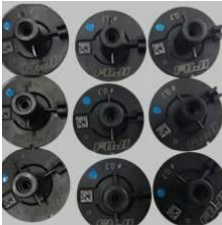
OEM NXT & AIM Nozzles