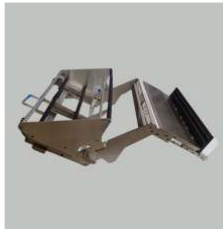
M6II Feeder Pallet