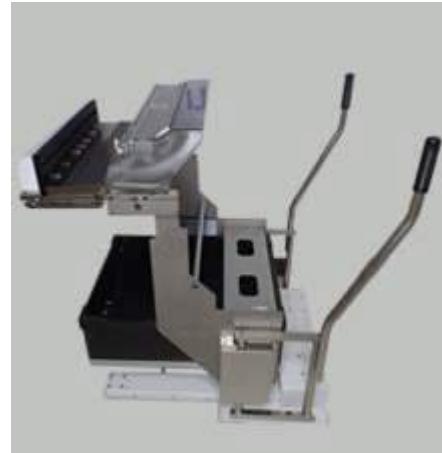
MFU for AIMEX