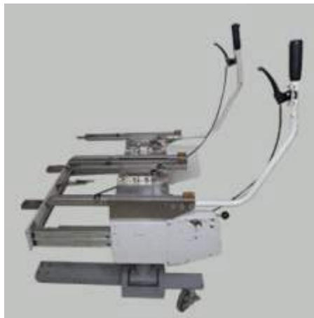
M3 Pallet Change Unit (Bucket Type)