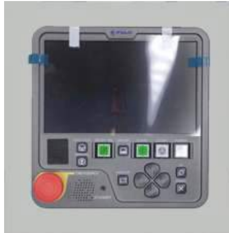
NXT Control Panel