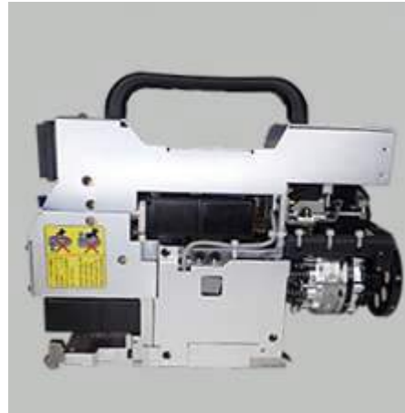
H08 Placement Head