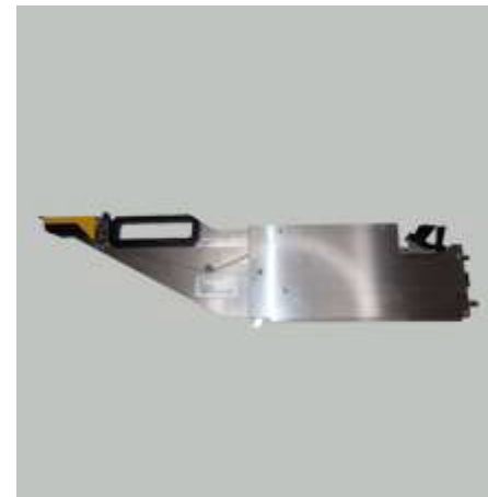
Jig Maintenance Feeder