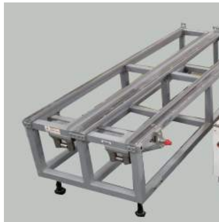
M3 & M6 Module Storage Unit